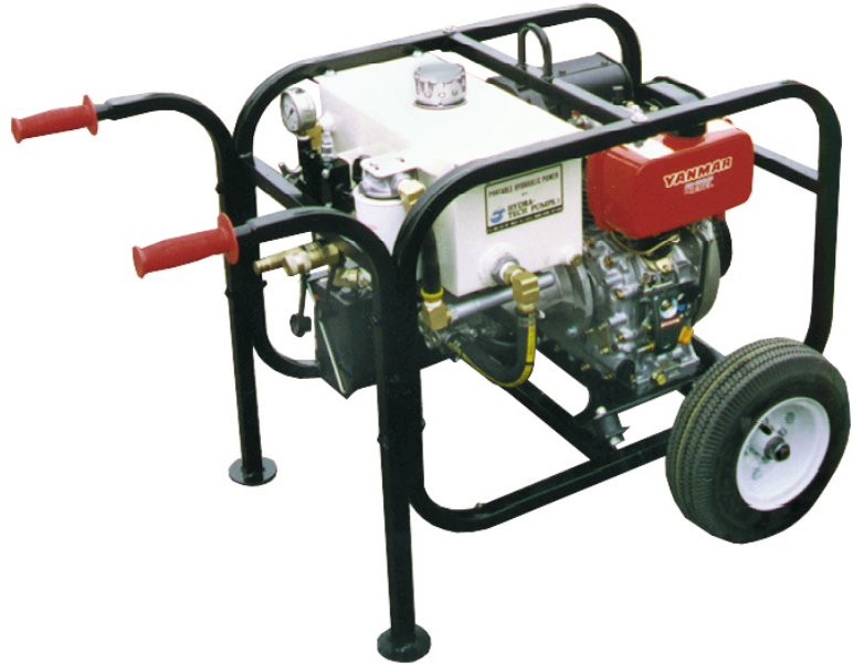
Unit shown with optional wheel kit

This portable diesel power pack is ideal for driving our 2" pumps and slim-line borehole pump. It also can provide hydraulic power to run many other hydraulic tools. Two models are available with flows of 3 GPM @ 2500 PSI or 4.5 GPM @ 1800 PSI.