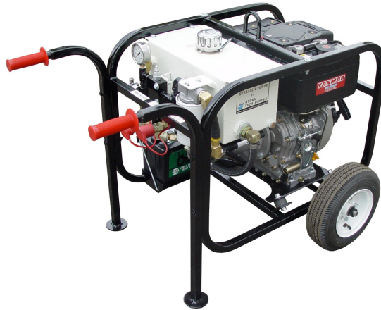
Unit shown with optional wheel kit

This portable and rugged diesel power pack is ideal for driving our 3" trash pumps and even our 6" high-volume propeller pump. It also can provide hydraulic power to run many other hydraulic tools using the variable speed throttle to control hydraulic output.